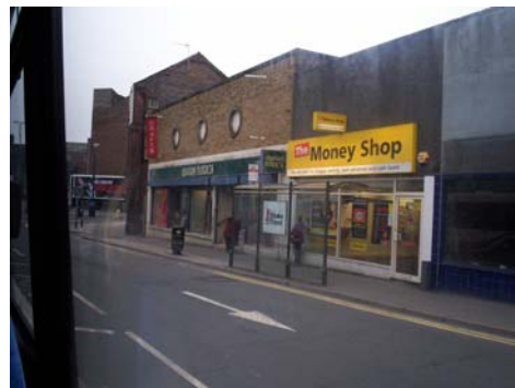
Abhakan Mill shop, Hanley