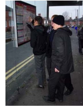
Know where we are going. Make sure its the right bus. Check the route...