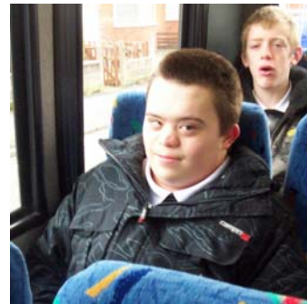
I can choose to sit by myself ...