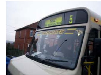
... the number of the bus ...