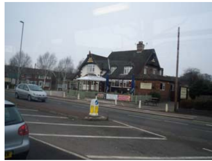
Finney Gardens Hotel