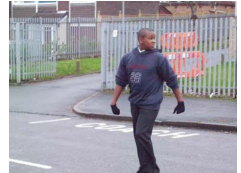
Keep looking and listening