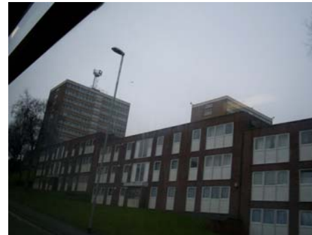
The flats, Hanley

Looking out for local landmarks ... Are you on the right bus?