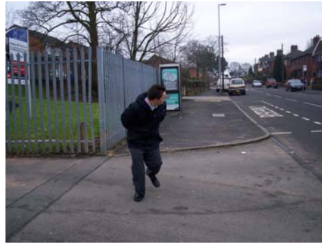
Look in all directions for vehicles