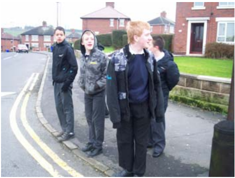
Stand a safe distance from the kerb