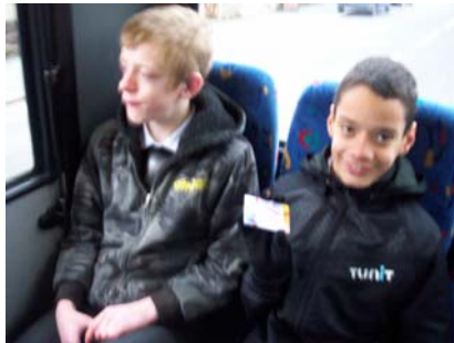
Sitting appropriately with my friends