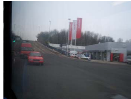
Lime Kiln traffic lights, Bucknall

Looking out for local landmarks ... Are you on the right bus?