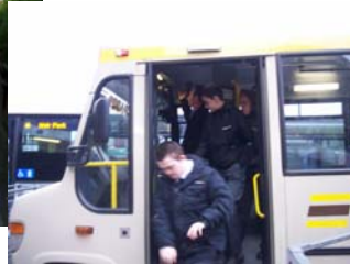
On and off the bus safely